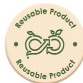
Tiger Cotton Tote Bag 100% GOTS Organic Cotton long handled tote bag.

To protect the biodiversity, people and planet, Tiger Cotton® works to convert conventional cotton farming to organic. Why Tigers? The first Tiger Cotton® farmers lived and worked side by side with the great Bengal Tiger in Madhya Pradesh, India. Tiger Cotton® is named after them and the tiger is a symbol of all the biodiversity and wildlife that regenerate when a conventional farmer converts into organic. It started out as a pilot project in collaboration with WWF India and has now grown into a full scale product-line converting farmers all over India.