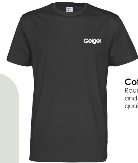
Cottover Unisex T-Shirt Roundneck T-shirt for men, women and children made in a cool, fine quality, fairtrade cotton. Modern fit.

Cottover garments are manufactured in Bangladesh which is the second largest producer of garments in the world! We question the trend of placing eco-friendly production only in Europe when most garments are actually produced in developing countries.