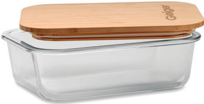
Tundra Lunch Box Lunch box in glass with bamboo lid and silicone band. Capacity 900 ml.