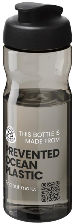
H2O 65ml Screw Cap Lid