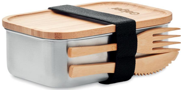
Savannah Lunch Box Stainless Steel lunch box with bamboo lid and 2 cutlery utensils with attachable polyester band. Capacity 600ml.