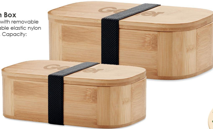
Bamboo Lunch Box Bamboo lunch box with removable divider and attachable elastic nylon strap. Dry food only. Capacity: 1000ml or 650ml.