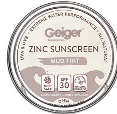
Sunscreen Can 30ml zinc can with printed label.

Every year, 14,000 tons of sunscreen are washed into the ocean from swimmers, leading to widespread destruction of marine life. 10% of the world's coral reefs are threatened by bleaching caused by the most commonly used chemical UV filter, Oxybenzone. To counteract the problem, our sunscreens are scientifically certified to be 100% safe for marine life. We are also proud to partner with Nordic Ocean Watch and Sea Going Green: two organisations dedicated to making sure our oceans thrive and having a positive impact on our planet.