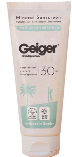
Sunscreen Tube 50ml tube with printed label.