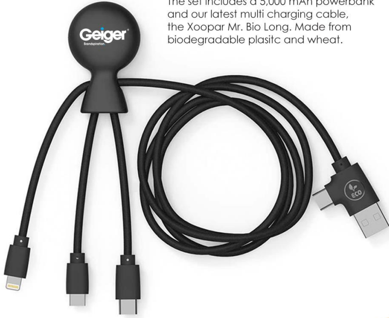
Xoopar Mr Bio Power Pack The set includes a 5,000 mAh powerbank and our latest multi charging cable, the Xoopar Mr. Bio Long. Made from biodegradable plastic and wheat.